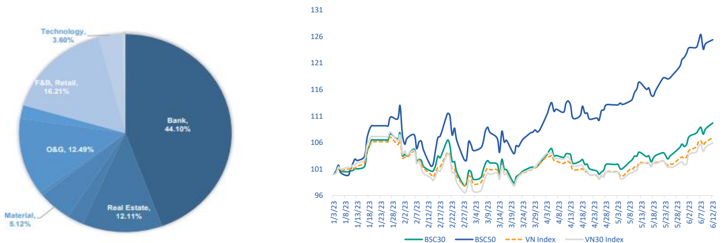
BSC30, BSC50 performance compared to the market

The BSC30 portfolio includes 30 companies with the largest market capitalization with the largest liquidity on all three Ho Chi Minh Stock Exchange (HOSE), Hanoi Stock Exchange (HNX), and Ho Chi Minh Stock Exchange Decentralized (Upcom). The companies in the BSC30 represent many important economic sectors, including banking, securities, consumer goods, retail, technology, manufacturing, logistics, electricity, and real estate. The stocks in BSC 30 are evaluated and selected by BSC experts based on the criteria of stable business operation, strong finance, effective management, and good competition in the market. Investing in stocks in the BSC30 portfolio is considered a reliable choice for investors who want to invest in Vietnam's stock market. The BSC30 portfolio will be published quarterly by BSC.