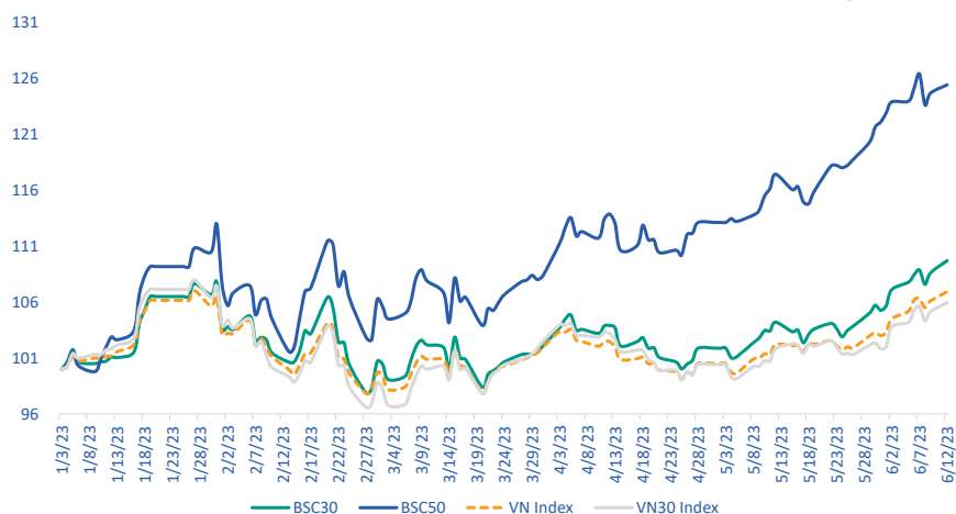
BSC30, BSC50 performance compared to market (Details - page 4)