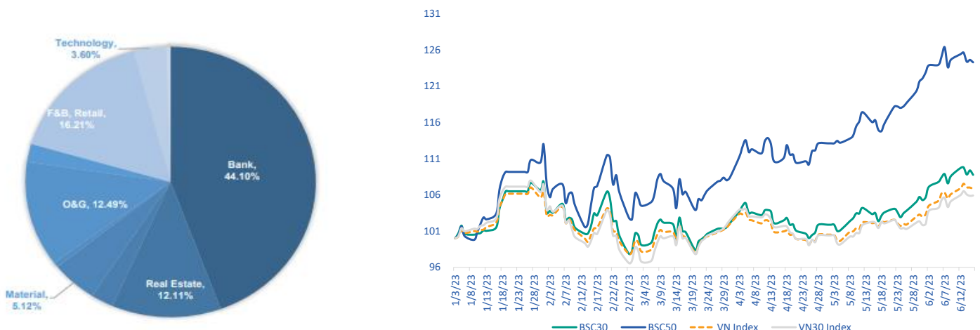
BSC30, BSC50 performance compared to the market

The BSC30 portfolio includes 30 companies with the largest market capitalization with the largest liquidity on all three Ho Chi Minh Stock Exchange (HOSE), Hanoi Stock Exchange (HNX), and Ho Chi Minh Stock Exchange Decentralized (Upcom). The companies in the BSC30 represent many important economic sectors, including banking, securities, consumer goods, retail, technology, manufacturing, logistics, electricity, and real estate. The stocks in BSC 30 are evaluated and selected by BSC experts based on the criteria of stable business operation, strong finance, effective management, and good competition in the market. Investing in stocks in the BSC30 portfolio is considered a reliable choice for investors who want to invest in Vietnam's stock market. The BSC30 portfolio will be published quarterly by BSC.