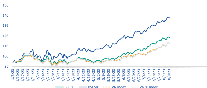
BSC30, BSC50 performance compared to market (Details - page 4)