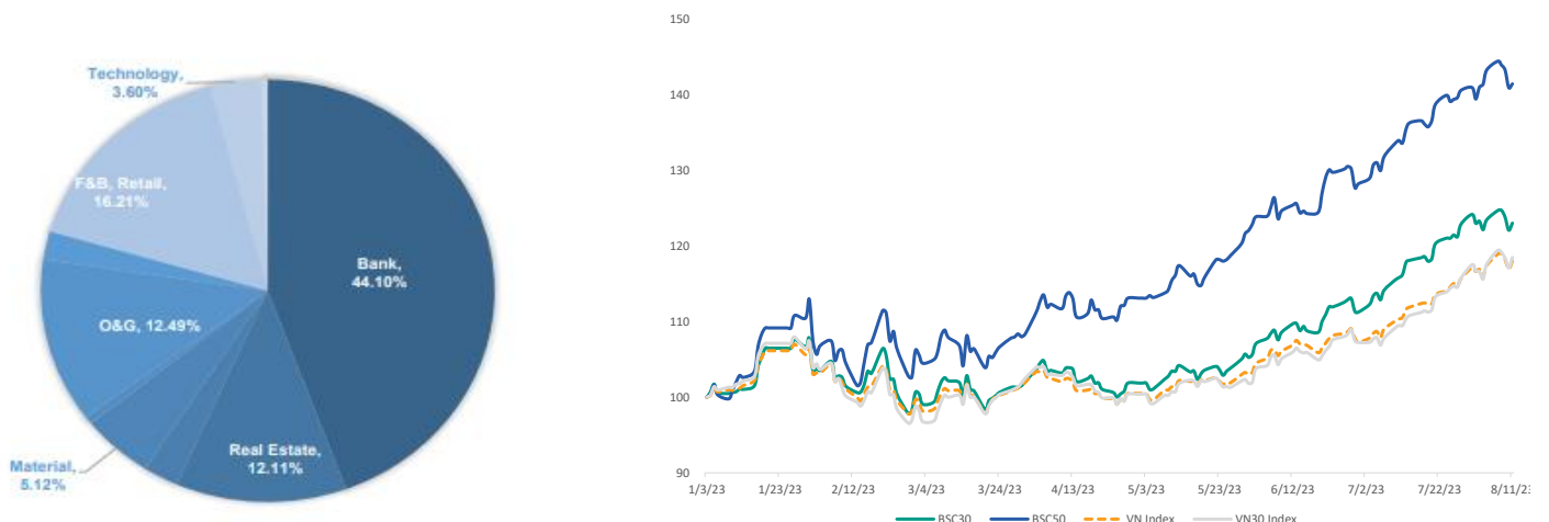
BSC30, BSC50 performance compared to the market

The BSC30 portfolio includes 30 companies with the largest market capitalization with the largest liquidity on all three Ho Chi Minh Stock Exchange (HOSE), Hanoi Stock Exchange (HNX), and Ho Chi Minh Stock Exchange Decentralized (Upcom). The companies in the BSC30 represent many important economic sectors, including banking, securities, consumer goods, retail, technology, manufacturing, logistics, electricity, and real estate. The stocks in BSC 30 are evaluated and selected by BSC experts based on the criteria of stable business operation, strong finance, effective management, and good competition in the market. Investing in stocks in the BSC30 portfolio is considered a reliable choice for investors who want to invest in Vietnam's stock market. The BSC30 portfolio will be published quarterly by BSC.