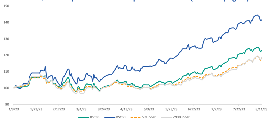
BSC30, BSC50 performance compared to market (Details - page 4)