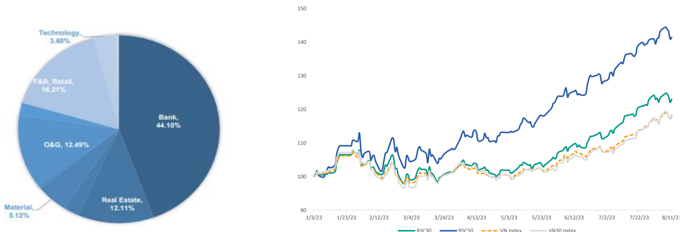
BSC30, BSC50 performance compared to the market

The BSC30 portfolio includes 30 companies with the largest market capitalization with the largest liquidity on all three Ho Chi Minh Stock Exchange (HOSE), Hanoi Stock Exchange (HNX), and Ho Chi Minh Stock Exchange Decentralized (Upcom). The companies in the BSC30 represent many important economic sectors, including banking, securities, consumer goods, retail, technology, manufacturing, logistics, electricity, and real estate. The stocks in BSC 30 are evaluated and selected by BSC experts based on the criteria of stable business operation, strong finance, effective management, and good competition in the market. Investing in stocks in the BSC30 portfolio is considered a reliable choice for investors who want to invest in Vietnam's stock market. The BSC30 portfolio will be published quarterly by BSC.