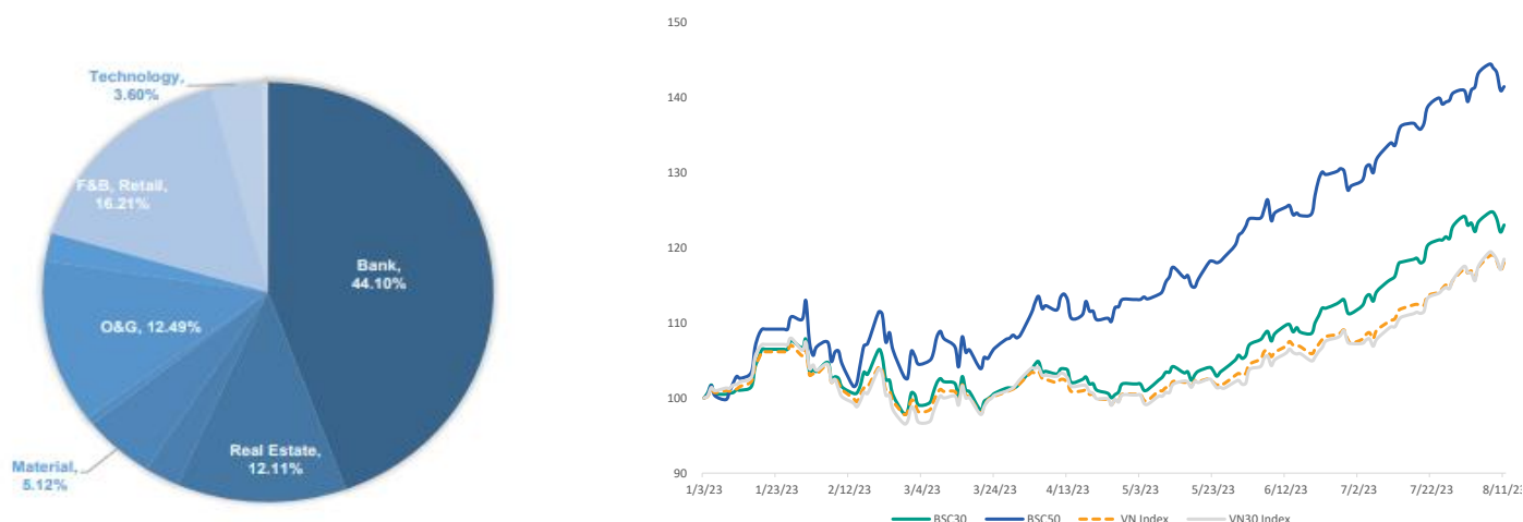
BSC30, BSC50 performance compared to the market

The BSC30 portfolio includes 30 companies with the largest market capitalization with the largest liquidity on all three Ho Chi Minh Stock Exchange (HOSE), Hanoi Stock Exchange (HNX), and Ho Chi Minh Stock Exchange Decentralized (Upcom). The companies in the BSC30 represent many important economic sectors, including banking, securities, consumer goods, retail, technology, manufacturing, logistics, electricity, and real estate. The stocks in BSC 30 are evaluated and selected by BSC experts based on the criteria of stable business operation, strong finance, effective management, and good competition in the market. Investing in stocks in the BSC30 portfolio is considered a reliable choice for investors who want to invest in Vietnam's stock market. The BSC30 portfolio will be published quarterly by BSC.